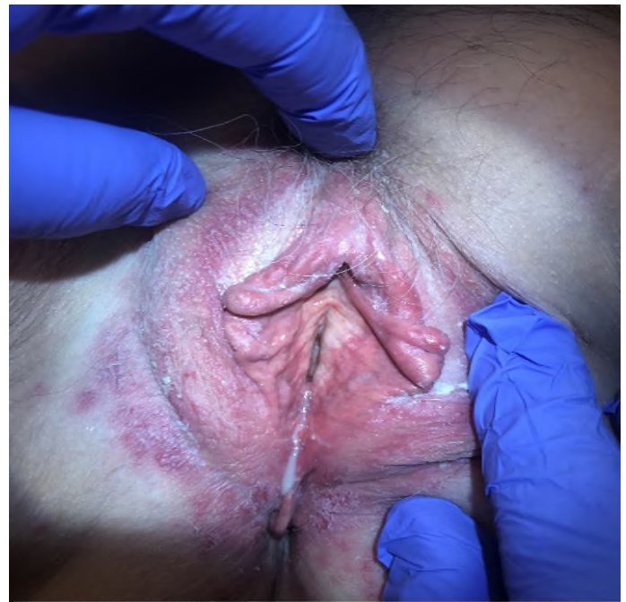
Figure 1: Before treatment. Vulvovaginal candidiasis showing extensive patchy erythematous rash extending to bilateral inguinal folds with subclitoral thickening, labial swelling, and diffuse vestibular erythema.

Prevalence of VVC in postmenopausal women remains understudied but is reportedly low in non-HRT users, ranging from 3% to 7% [6,7]. When VVC presents in postmenopausal women it is frequently missed and not considered, especially in those with no prior history of VVC. Post-menopausal patients are still susceptible to being colonized by fungal organisms despite being estrogen deprived [8]. When VVC does occur in postmenopausal women, likely contributory factors are hormone replacement therapy, unrecognized and uncontrolled diabetes mellitus, and the use of topical steroids. Added to this list in post-menopausal diabetics are the entire class of SGLT2 inhibitors [9,10]. We report a case of severe vulvovaginal candidiasis in a postmenopausal woman who has been on empagliflozin. RVVC was managed with induction and maintenance fluconazole therapy and discontinuation of empagliflozin. There is a